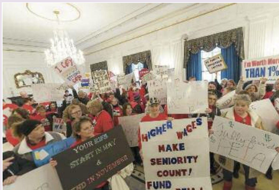
Teachers occupy the State Capitol during the strike

As one activist has explained to me, they are negotiating with, that is, fighting both union honchos and the state, trying to use the union apparatus while not allowing it to