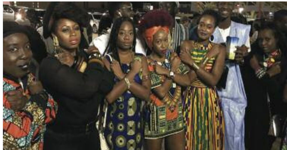
Audiences in Africa (pictured, a Senegalese audience) have flocked to see 'Black Panther'.

It hid itself throughout the ages, aware of the colonisation and pillaging of the rest of the continent. This is not solidarity. This is addressed by the introduction of the character Killmonger. Michael B. Jordan's character becomes the primary antagonist. Why is he significant?