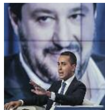
Foreground Di Maio, background Salvini

But the hoped-for electoral breakthrough didn't materialise, with a dismal 1.12% score, indicating that in Italy no real mass organised social-political terrain similar