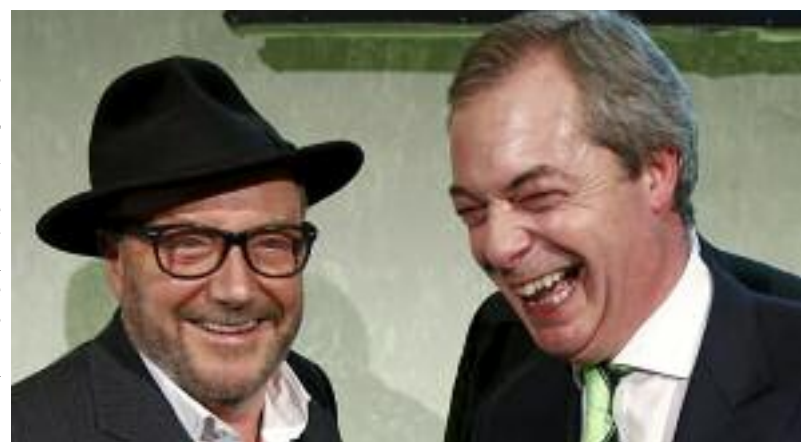
United in anti-AWLism: George Galloway and Nigel Farage. Now joined by The Daily Express and Ashok Kumar

We do not think that Israel should be subjugated and destroyed, and its Jewish people put at the mercy of the conquerors. But whatever anyone thinks, that is not calculably going to happen. It presupposes tremendous