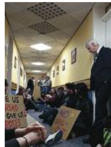
Left: London UCU demonstration, 28 February. Right: Aberdeen students in occupation.

out of 64 universities on strike had held votes which rejected the agreement. The branch representatives' meeting voted unanimously to reject the deal and reopen negotiations and the Higher Education Committee quickly followed with a vote to reject the agreement and keep the strikes on.