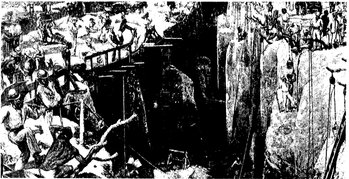
Diamond mining in the 1870s