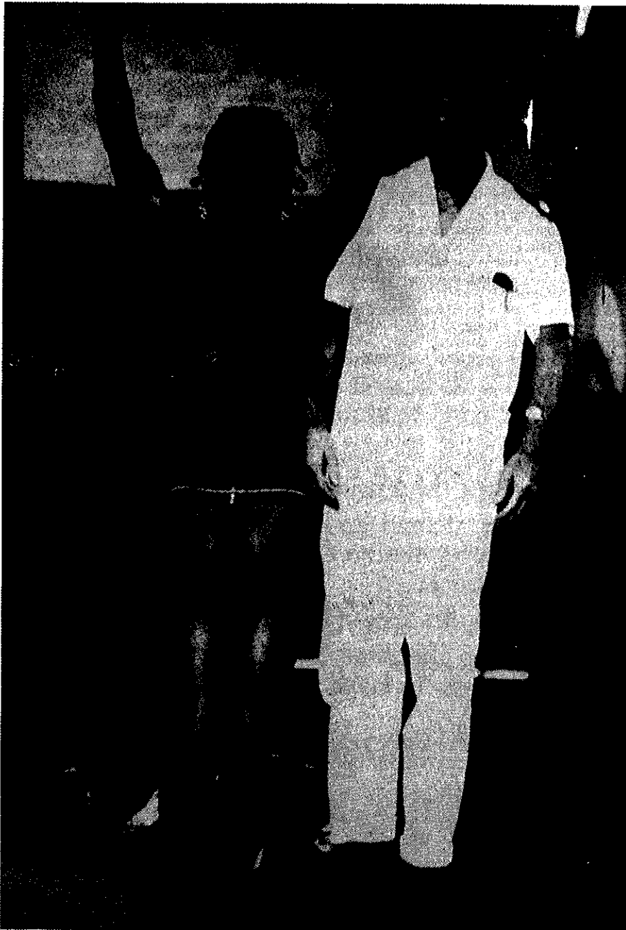
A black miner is strip-searched