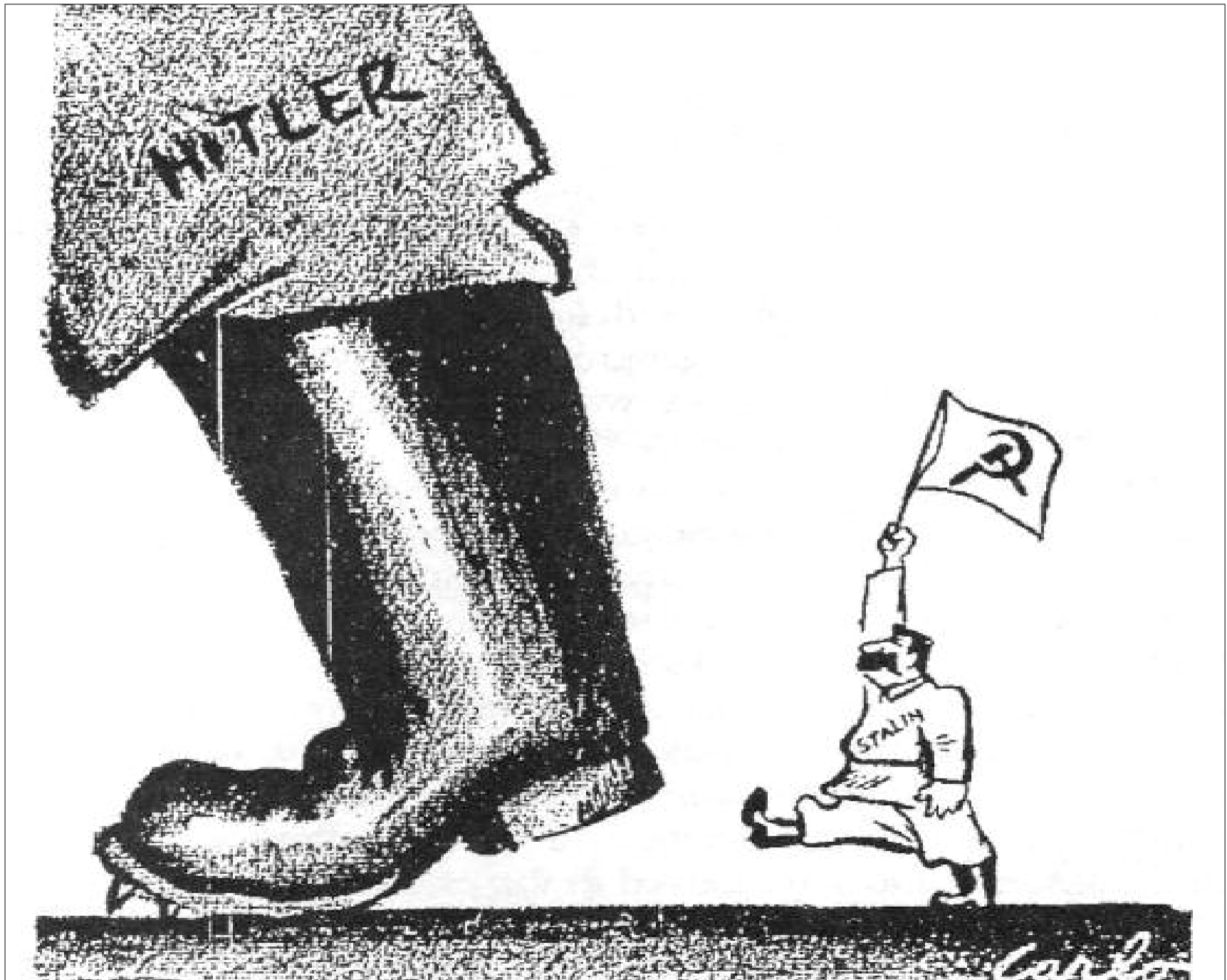
Contemporary cartoon by the Trotskyists. Where Hitler leads, Stalin follows.