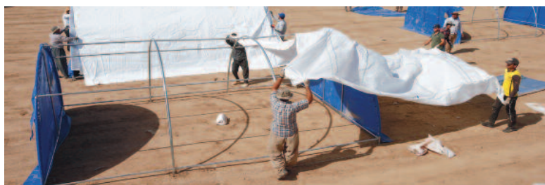
Tent camp being prepared in Khazer, Iraq, for refugees fleeing Mosul

Abadi insists that the Shia militias should not enter Mosul itself, but the influence which they and Iran hold over his government and other institutions including the army remains a threat to a politi-