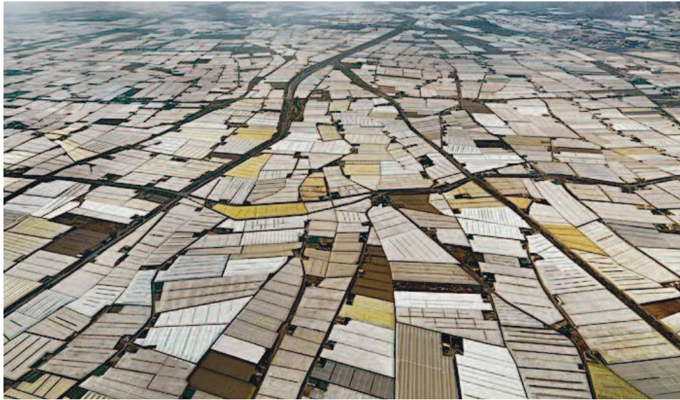
Industrial farming in Spain

This problem may also be seen in the man-