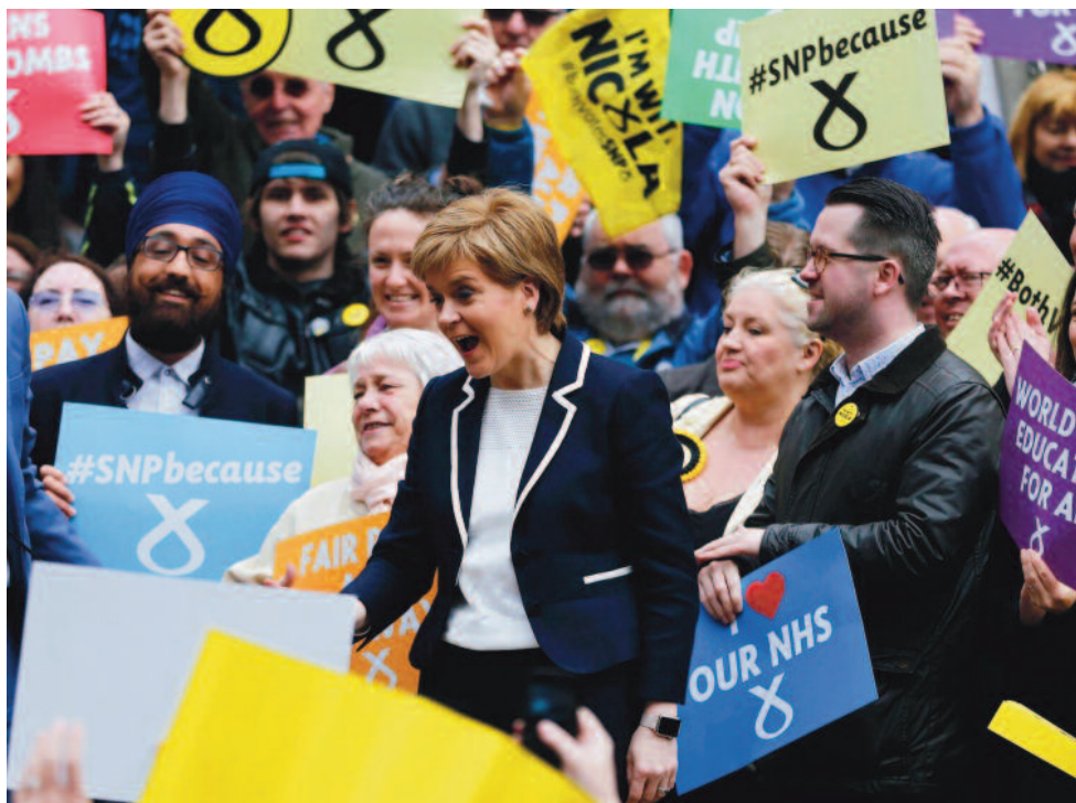
Nothing to see here?

The expression "Jewish/Israeli lobbyists" is defended on the basis that one lobby is merely the new version of an older one. This is certainly true – in the sense that the contemporary trope of the powerful Israeli lobby is used as the direct successor of the older trope of the powerful Jewish lobby: "It used to be called the Jewish lobby, now called the Israeli lobby. Same lobbyists and same peo-