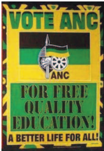
Broken promises from the ANC?

The rest of the working class has taken notice and has drawn this lesson.