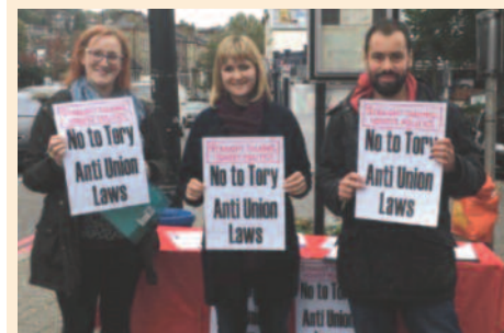
Lewisham Momentum supporters