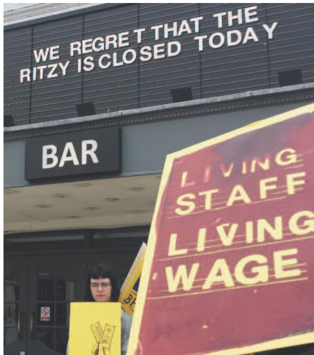
Inspiring class struggle in 2014: Ritzy cinema strike

There is a risk that socialists attempt to substitute for unions, taking on all of the fundamental but often time-consuming and draining tasks of producing basic literature and organising and facilitating meetings. Without a vibrant and