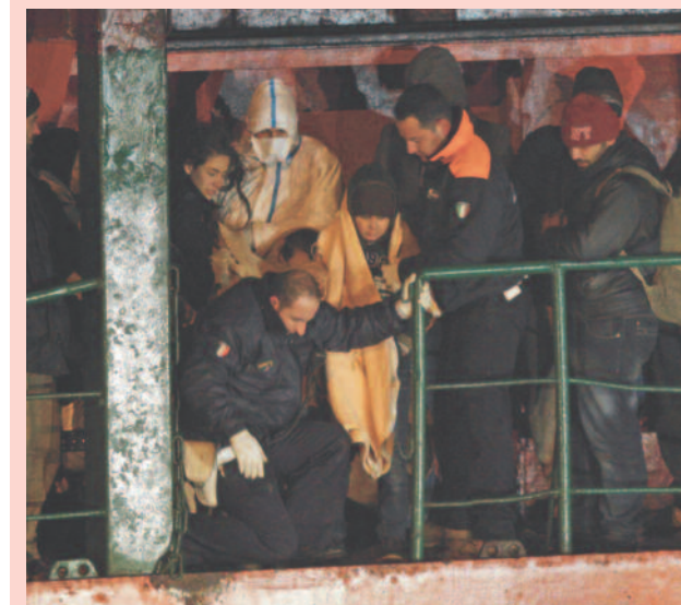
Rescued from Blue Sky M

These catastrophes prove that whether or not Mare Nostrum was acting as a "pull factor" in bringing migrants into Europe, there will still be families fleeing horrific situations of war and political repression on their doorstep.