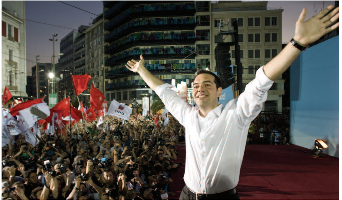
Syriza leader Alexis Tsipras

The second Memorandum was due to expire on 31 December. The Samaras government made an agreement with the Troika for a two month extension period while the “fine details” of the next Memorandum — which certainly will not be called “Memorandum” — are agreed. Samaras had hoped to announce that Greece would leave the “bail-out”, but the extension was the best he could do, since the Troika was not prepared to accept the stories about “return to growth” and “return to the markets” with which the government had sat-