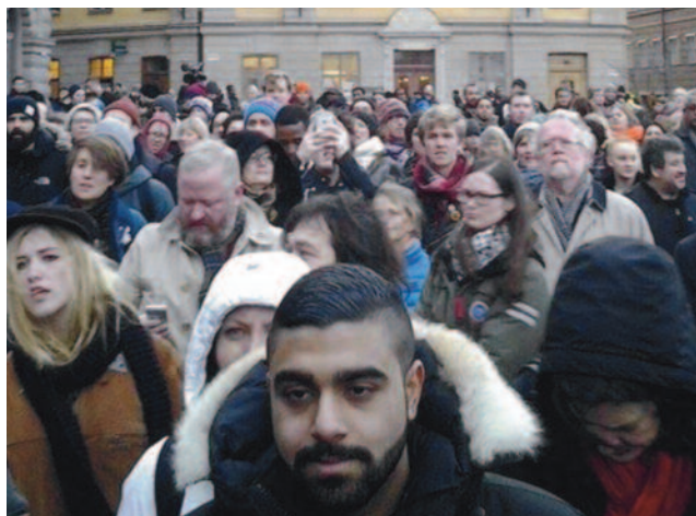
Crowd assembled for a solidarity rally between the Riksdag and the Royal Palace in central Stockholm on 2 January

yet the emerging popular resistance to racism has often been reactive and leaderless in character.