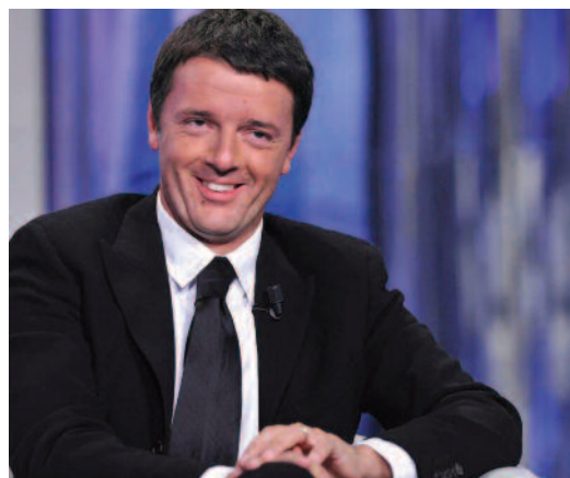
Italian prime minister Matteo Renzi

They remain the goal that Renzi and Berlusconi need to guarantee not just their own political survival, but even the stability and survival of any kind of formal bourgeois order.