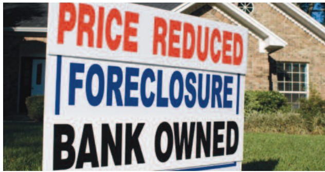
Mortgage debt is the biggest proportion of household debt

Since interest rates on credit cards, payday loans, and the like are much higher than on mortgages, it may be that consumer-credit interest payments are a much bigger propor-