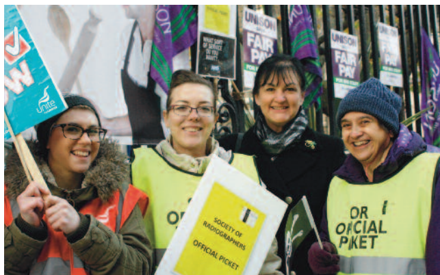
Health workers picketing Guys Hospital, London, in November

Health unions are calling for an immediate 1% consolidated pay rise for all NHS staff, with a further consolidated award for 2015-16 and future increases that they